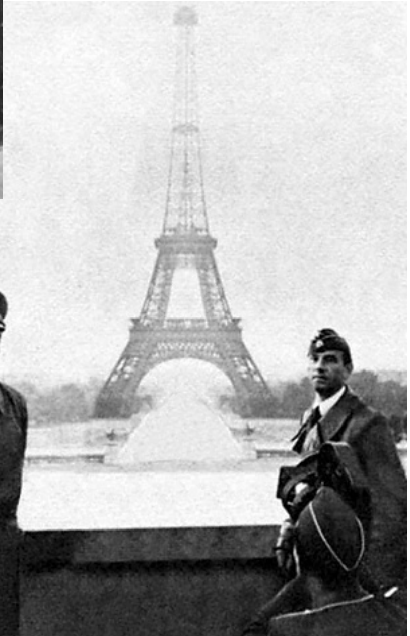
Clockwise from top right: Sign: Jews Are Not Welcome Here, Execution at the Lodz Ghetto, Hitler in Paris, Nazis at the University of Vienna.